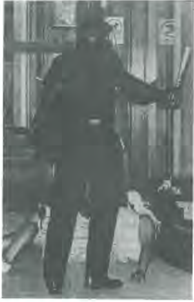
More police will not stop attacks on women!

Now the police openly admit this with their talk of training officers to eradicate these sexist attitudes. Why should this be any more successful than their 'education' to counteract their racist attitudes? Police "prejudice", whether against blacks, women, people working class strikers or in general is a product of their