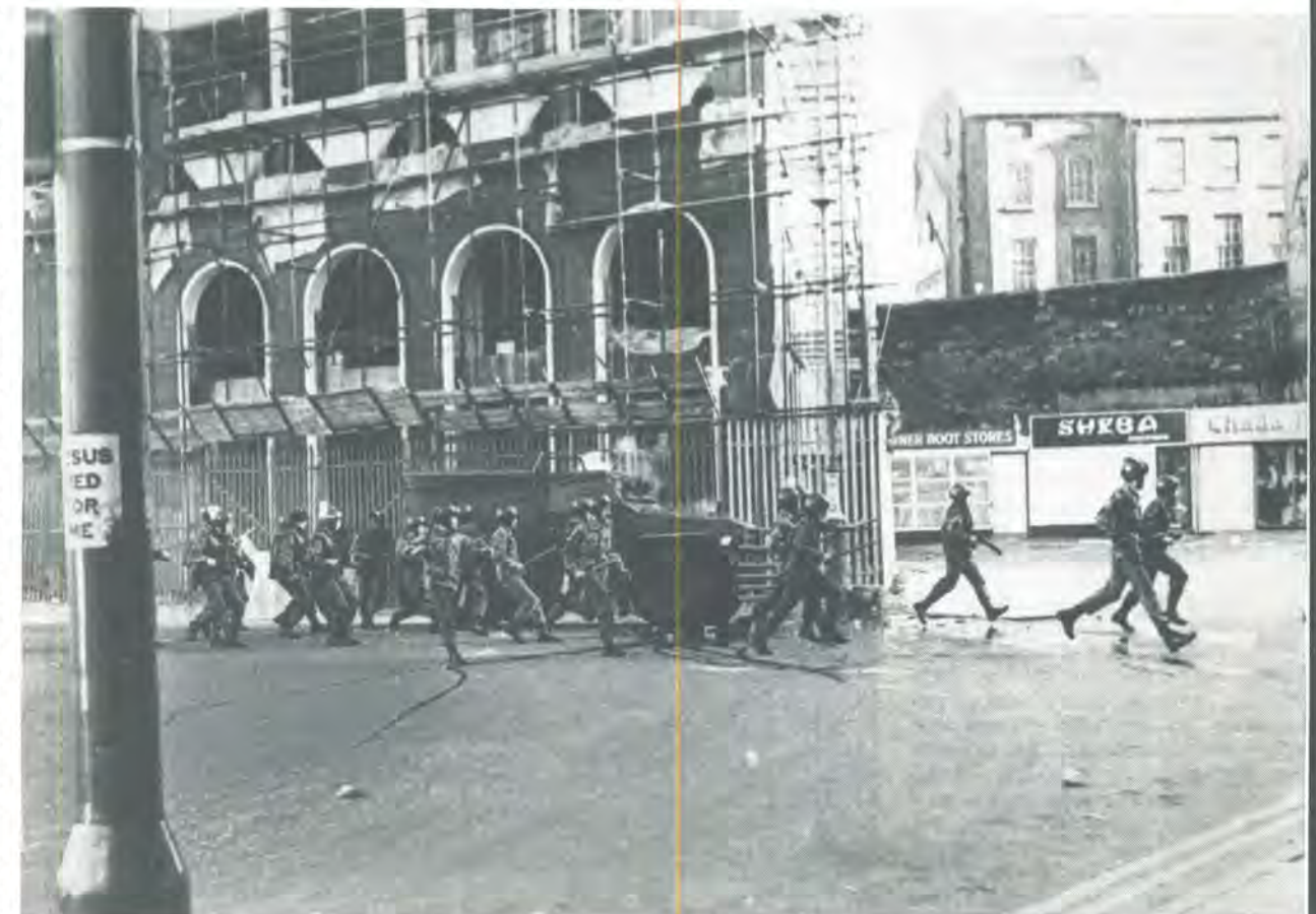
'Workers in uniform' clock on for a shift in Derry

unemployment amongst Protestants 12%, Catholic unemployment stands at 30%. A report in 1981 showed that there was not one single Catholic skilled worker at the Harland and Woolf Shipyard. Protestant workers dominate the skilled labour market, which has been boosted by US and government contracts to the main Protesand Woolf and the Hughes Tool Company.