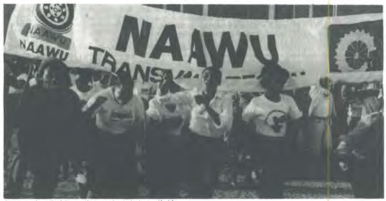
Black trade unionists on the march against apartheid

We don't like using intimidation but this is necessary otherwise we have no hope of winning. We held our strike solid and won all our demands.